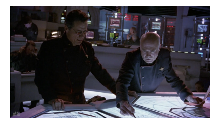
Figure 1: Reluctant to rely on computers to assist in planning, Captain Adama and Executive Officer Tigh calculate and revise tactics offline using printed navigation charts and pencil-and-paper.

FSE'16 , November 13–18, 2016, Seattle, WA, USA ACM. 978-1-4503-4218-6/16/11... http://dx.doi.org/10.1145/2950290.2983986