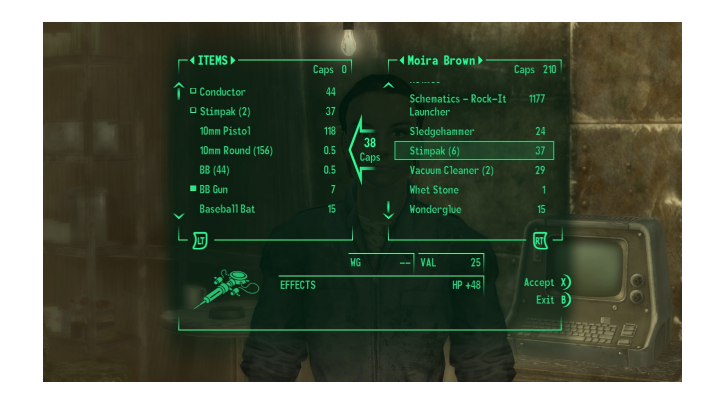
Figure 2: The people in Fallout rely on a bartering economy as a fundamental means of exchanging goods and services.

The benefits of a 'pencil-and-paper IDE' apply not just to dystopia but might have applications even today. As one example, having a pencil-and-paper IDE can enable developers to write algorithms, even when they are in situations where consistent access to computers is not available. Importantly, some developers even postulate that there are cognitive benefits to writing code away from the computer [14].